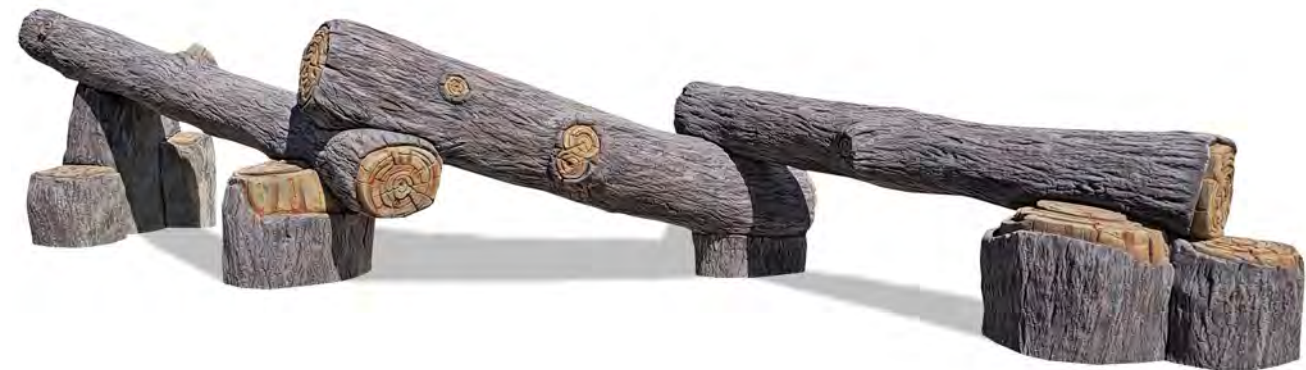
3 Log Traverse_AP015